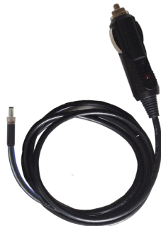
SPS-12 Optional Cigar Lighter Cable (Model AC-75 sold separately)